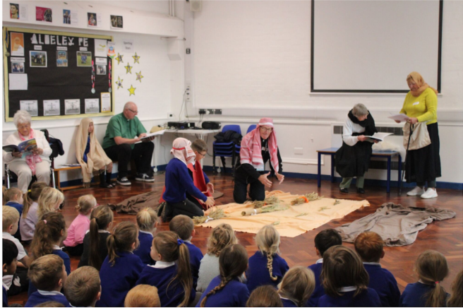
Open The Book Assembly