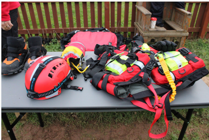
Search and Rescue in Forest School