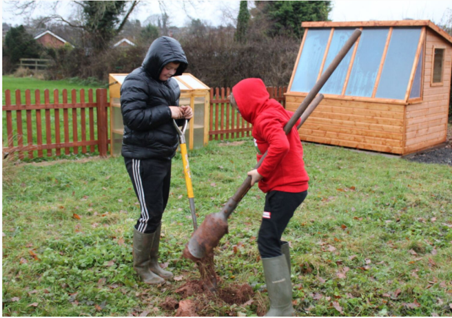
Fruit tree planting