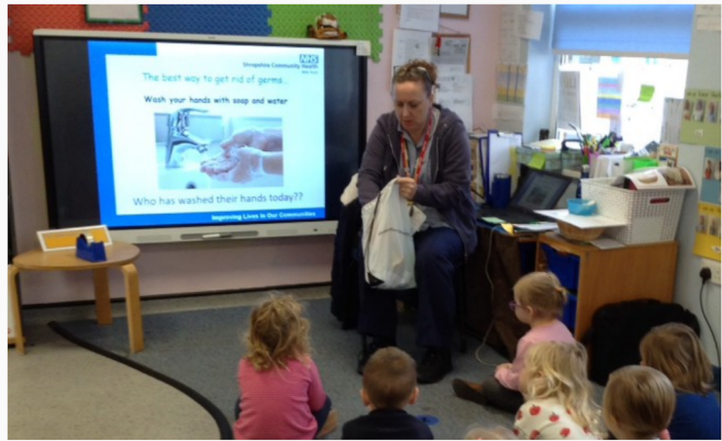
Hygiene and handwashing demonstration