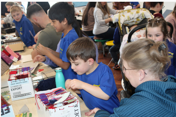
Elm parent workshop