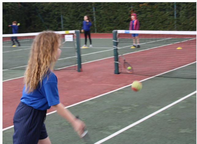
Tennis lessons at the Alveley Tennis Club