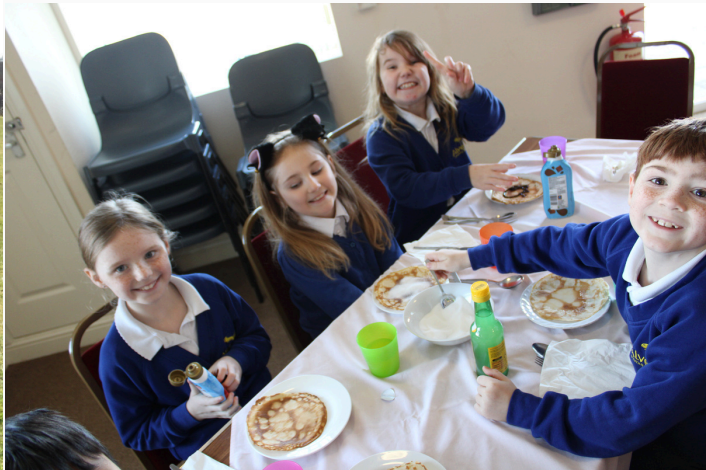
Pancakes at the Pavilion for Lent