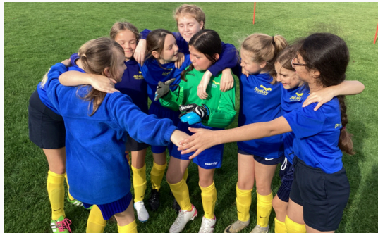
Girl's Football (Semi-finalists!)