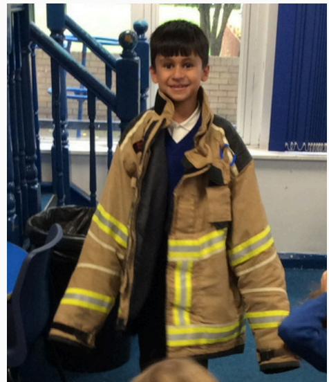
Fire Safety Assembly and Workshop