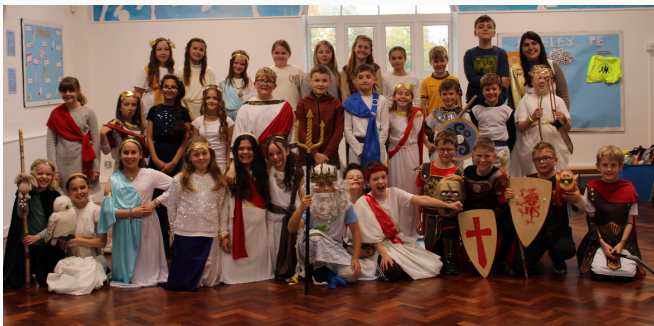
Ancient Greece Day