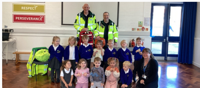
First Responder Assembly