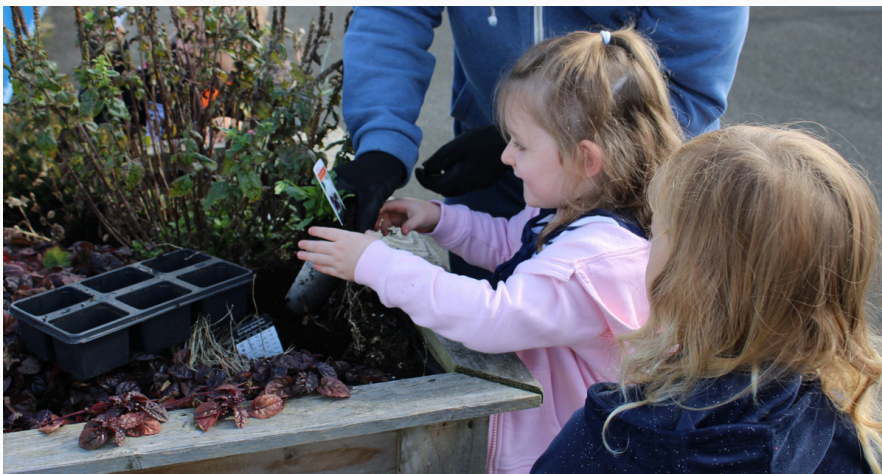
Flower Planting Around School